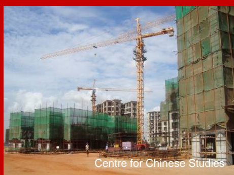
Centre for Chinese Studies

Senior Analyst, Centre for Chinese Studies