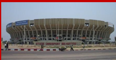
The Chinese-built Stade des Martyrs in Kinshasa

“China has positioned itself as a prominent actor in the DRC, a development that has certainly not gone unnoticed either domestically or internationally.”