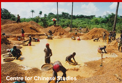
Centre for Chinese Studies

Also, it can be compared to other infrastructure rehabilitation packages, such as the US$ 110 million five-year road rehabilitation accord signed on July 8 by the DRC government, the World Bank and the UK, in terms of which roads in Orientale, South Kivu and Katanga provinces, totaling 1 800km, are to be refurbished. All things considered, it is clear that China has entered the picture at a time when the DRC needs its assistance, which has given the Asian powerhouse a very good bargaining position. Nonetheless, the agreement offers considerable developmental possibilities for the DRC. However, since a third of the country's budget is currently allocated towards debt repayments, the DRC could ideally use both debt relief and infrastructure refurbishment. By the end of March 2009 as the negotiations with the IMF are slated to restart, the possibilities for this will emerge.