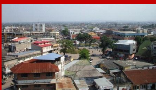
Aerial view over Kinshasa

China's renewed interest ten years after these events brought many Congolese the means to get out of misery and crisis. Some have likened impact of the arrival of the Chinese to that of the initial forays of European colonialists hundreds of years before.