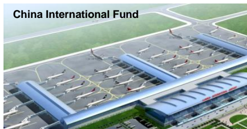
China International Fund

New International Luanda Airport to be concluded in 2010 The new International Luanda Airport will be built by China International Fund Limited. It is to be located 30 kilometres from the Angolan capital and due for completion in 2010. The airport will cover an area of 5,000 hectares and have two double runways, with the capacity to receive the world's largest commercial