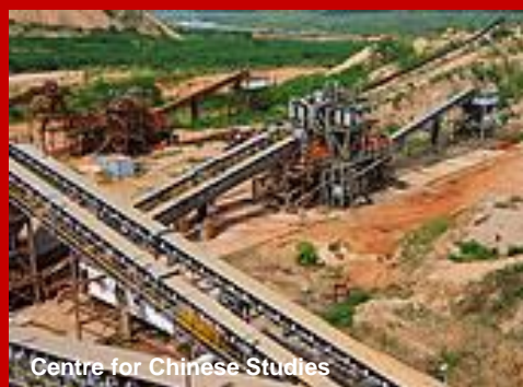
Centre for Chinese Studies

"The DRC may still be plagued by disease and absolute poverty and in the Eastern parts ravaged by war, but its mining sector is booming."